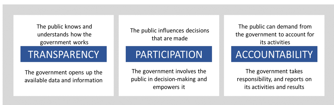
Fig. 3 OGP values

International Open Government Partnership | In 2009, the United States and Brazil initiated the Open Government Partnership (hereinafter, OGP) International Programme. The initiative currently involves 78 countries around the world, representing more than 2 billion people and thousands of civil society organisations through central and local government. This initiative is an international platform to help governments achieve greater transparency, accountability, fairness, and public participation in decision-making. Cooperation, exchange of good practices, and new technologies open up unique opportunities for countries to improve governance practices at the national, regional, and institutional levels. Country participation in the international initiative is based on the practical implementation of OGP principles and values (see Fig. 3)